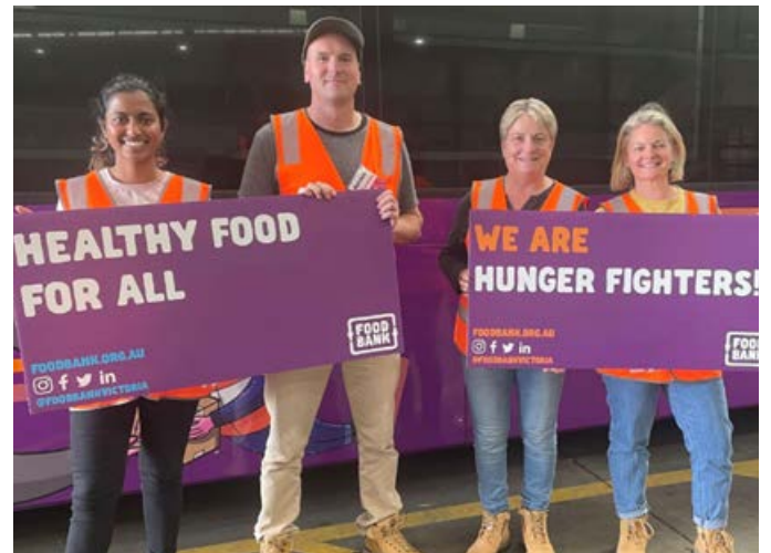
Altona and Yarraville team members supporting Foodbank food insecurity relief efforts on Foodbank's mobile supermarket bus.

As the new Melbourne Terminal, we are confident that Mobil will continue to play an important role in Victoria's fuel supply chain, reliably supplying our customers with quality Mobil fuels into the future.