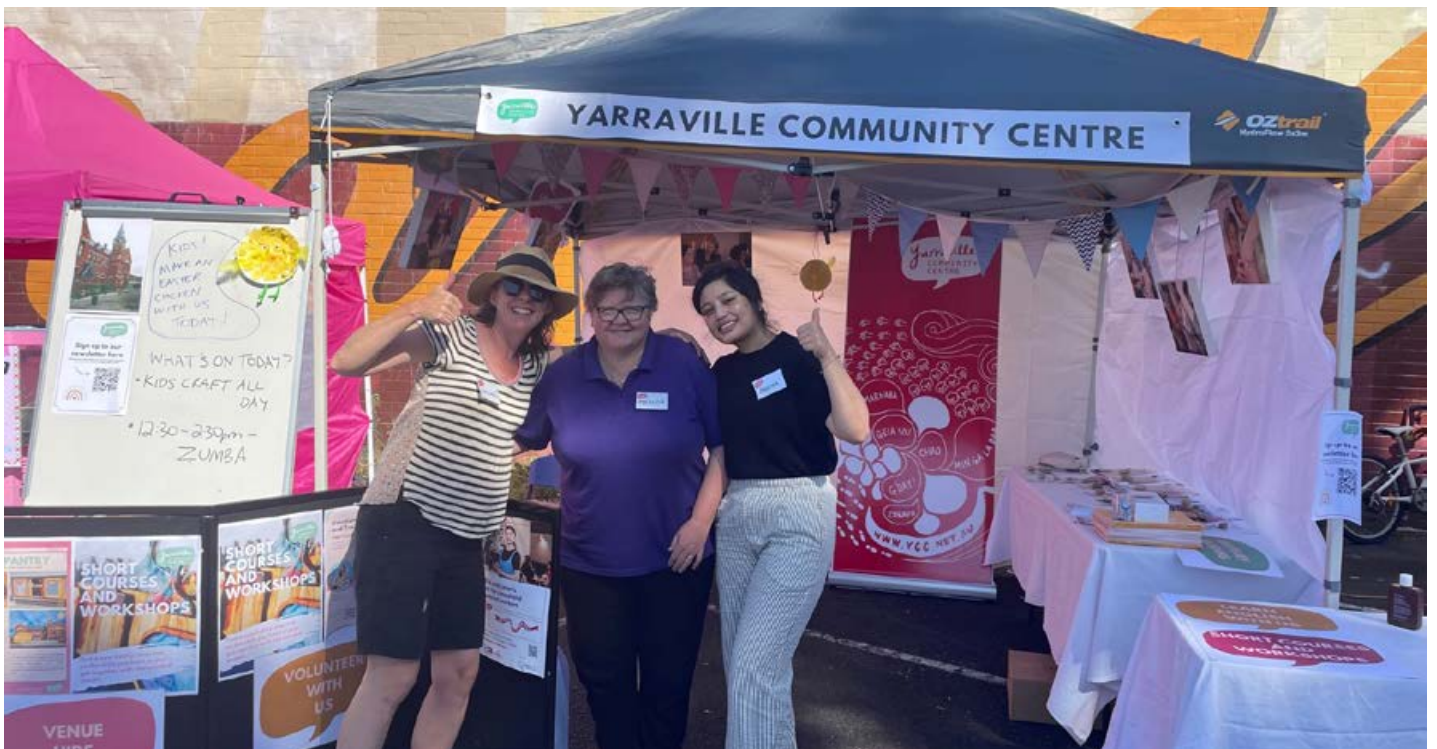
The Yarraville Community Centre team at the Mobil donated Yarraville festival stall.