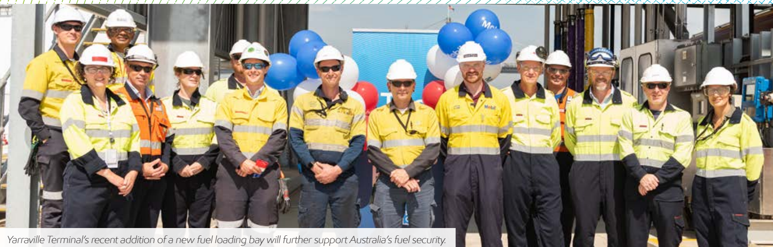
Yarraville Terminal's recent addition of a new fuel loading bay will further support Australia's fuel security.